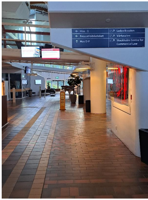
Below are the stairs.

Go in through the revolving doors and keep walking straight on until you enter a new hall slightly to the right (it is open and there are no doors to pass) and then you see some stairs.